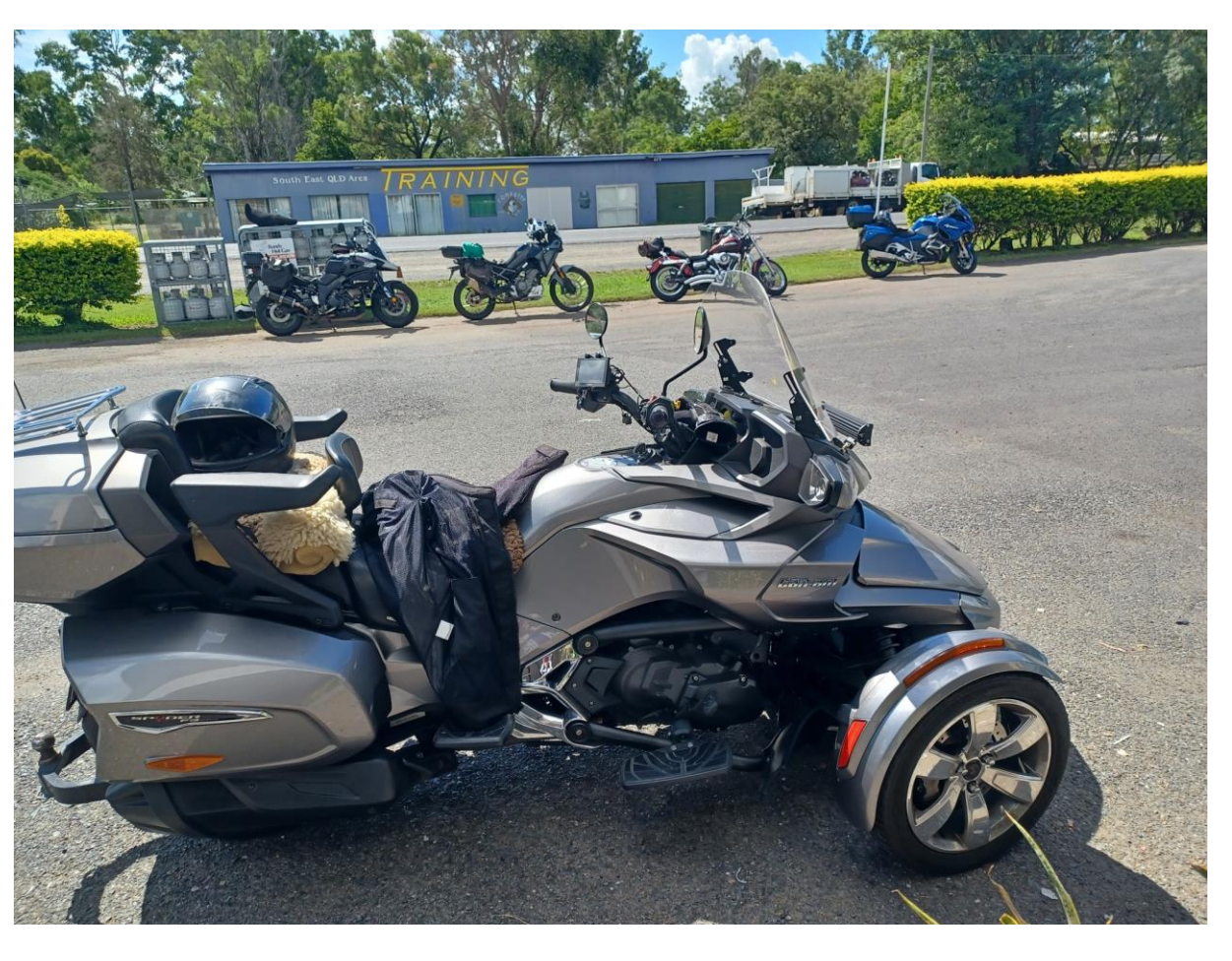
Some of the bikes at Biggenden