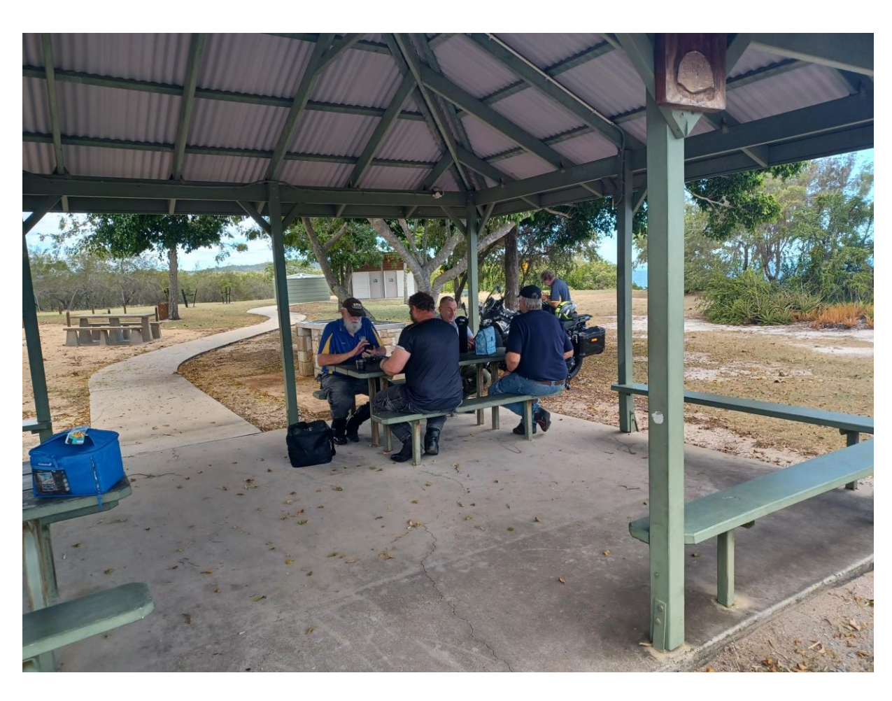
Riders having a BYO lunch