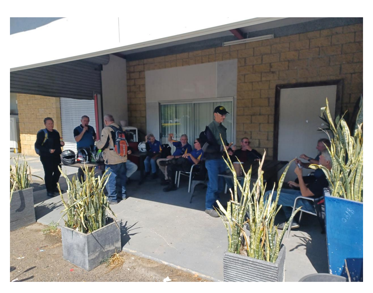
Ice-cream stop at Biggenden