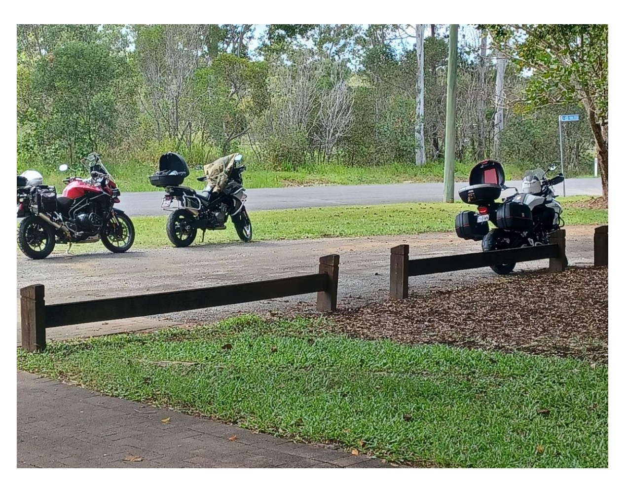
The bikes at Howard