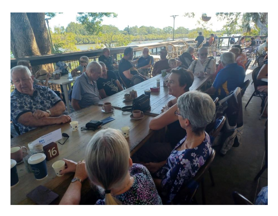
Some of the members at River Cruz Café