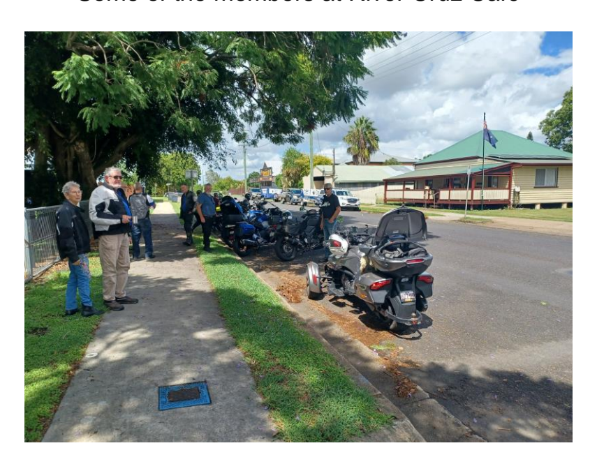
A comfort stop at Wallaville