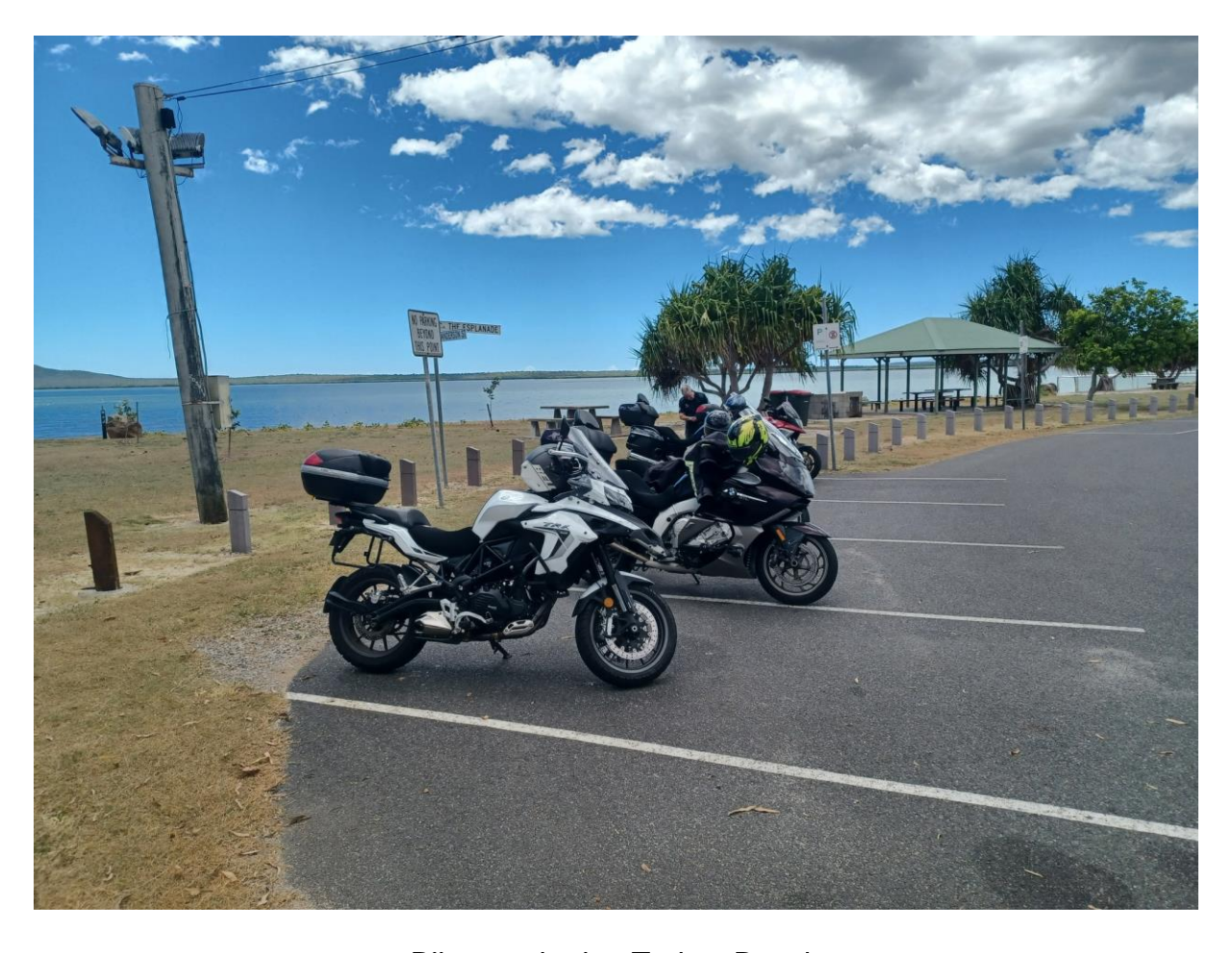
Bikes parked at Turkey Beach