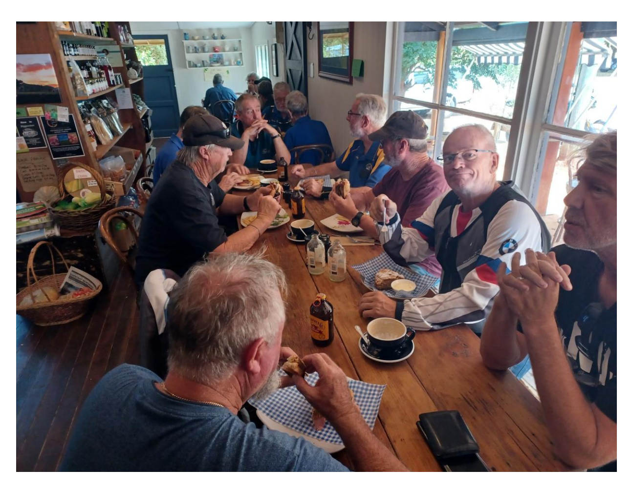
Lunch at the Coalstoun Lakes Café